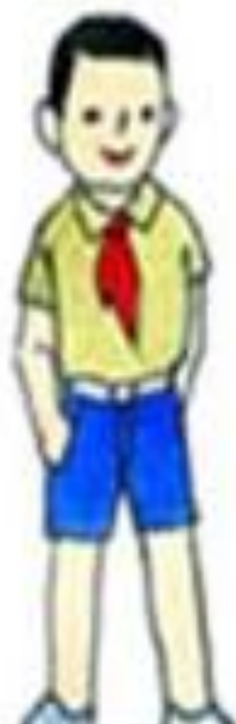
学龄期 6/7~11/12岁(女) 6/7~13/14岁(男)