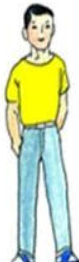
青春期 11/12~17/18岁(女) 13/14~18/20岁(男)